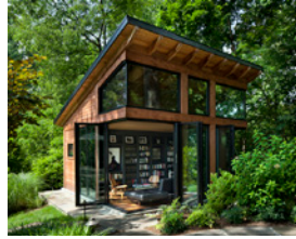
DADU – detached accessory dwelling unit

Just like it sounds, an AADU is a second unit attached to another unit on your property. The other unit could be an existing structure on your property, or you could build two new attached units together. 'Attached' simply means the units share a wall. A DADU is a distinct structure on the same property, but not connected to any other structures.