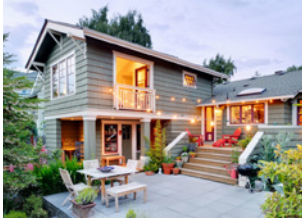
AADU – attached accessory dwelling unit

This is a big topic, but here's a very brief introduction to help you begin thinking about ADUs. First, the terminology: